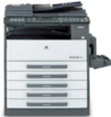
KONICA MINOLTA bizhub 181