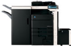
KONICA MINOLTA bizhub C552