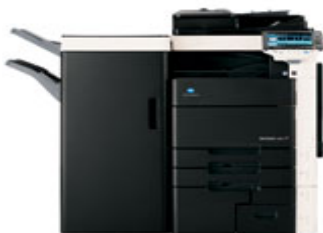
KONICA MINOLTA bizhub C652