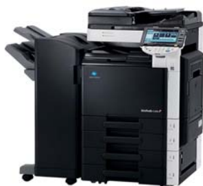
KONICA MINOLTA bizhub C280