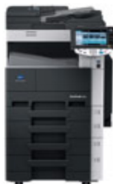
KONICA MINOLTA bizhub 283