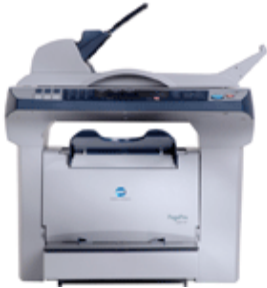
KONICA MINOLTA PagePro 1390MF