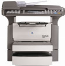
KONICA MINOLTA bizhub 161F