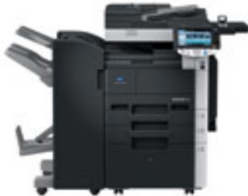
KONICA MINOLTA bizhub 423