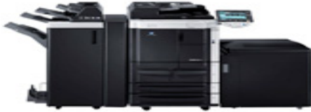
KONICA MINOLTA bizhub 751