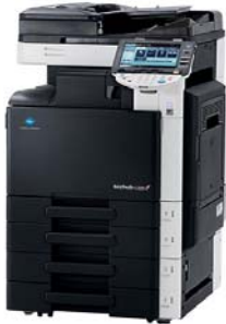
KONICA MINOLTA bizhub C220