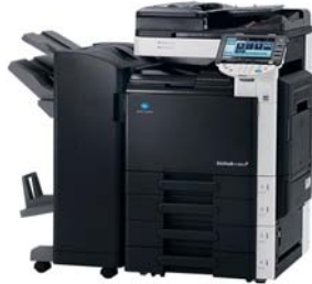
KONICA MINOLTA bizhub C360