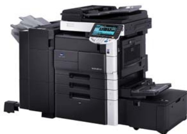
KONICA MINOLTA bizhub 501