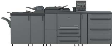
KONICA MINOLTA bizhub PRO 1051