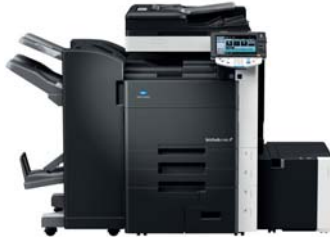
KONICA MINOLTA bizhub C452