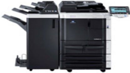
KONICA MINOLTA bizhub 601