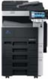
KONICA MINOLTA bizhub 223