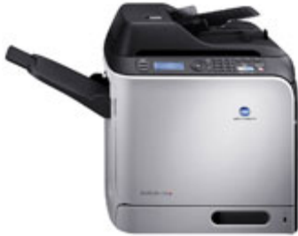
KONICA MINOLTA bizhub C20