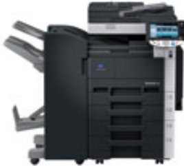
KONICA MINOLTA bizhub 363