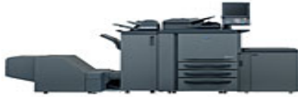
KONICA MINOLTA bizhub PRO 950